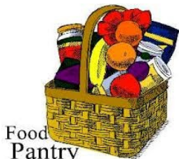
Food Pantry Ministry